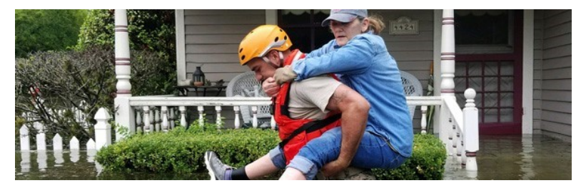
A Texas National Guardsman carries a resident from her flooded home following Hurricane Harvey in Houston

The destruction from recent hurricanes has been widely published and work has begun to help people recover. Residents of Texas, Florida, Louisiana, Puerto Rico, Barbuda, the Virgin Is-